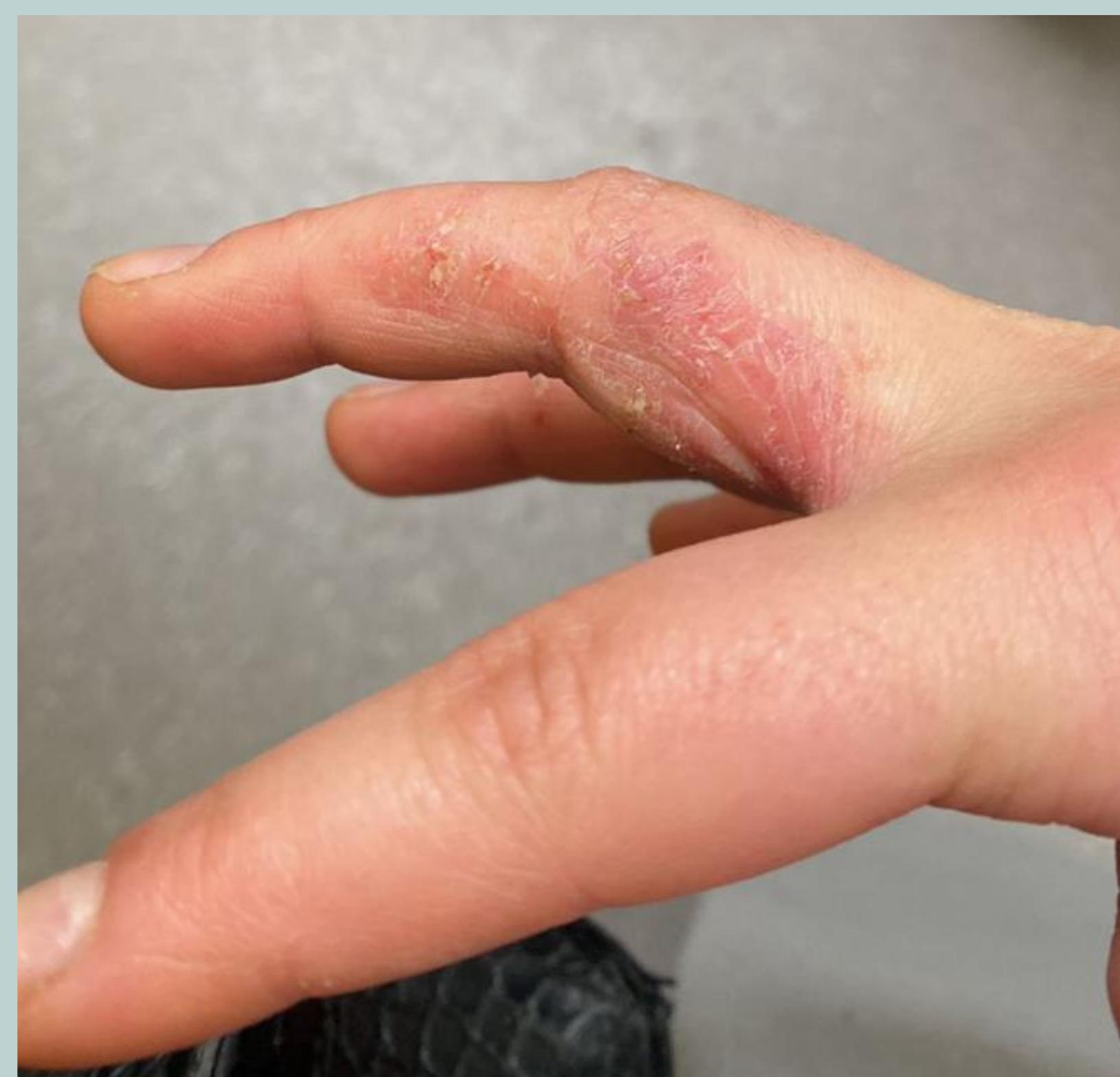
Figure 1: Dyshidrotic eczema of the hands since >6 months