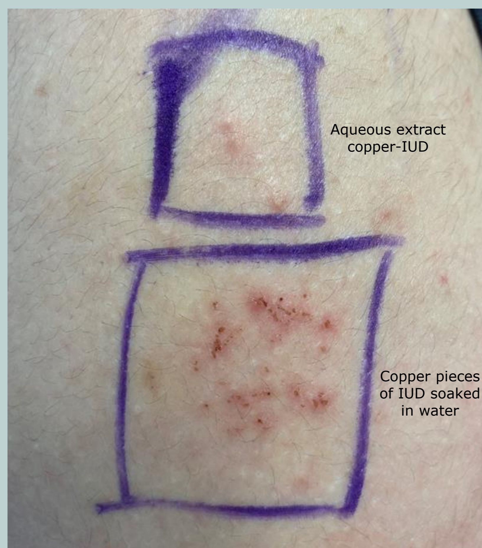
Figure 3: Positive patch test reactions to a water extract of copper pieces, and to the (soaked) copper pieces