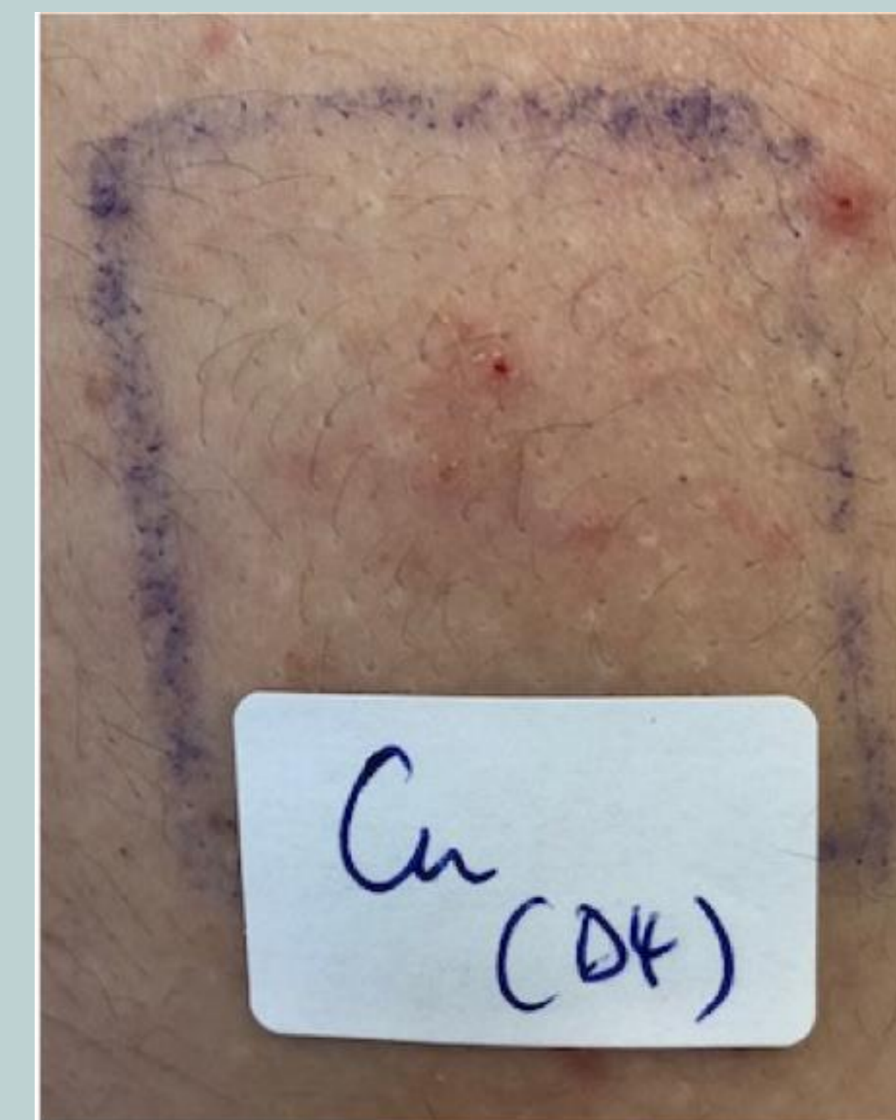
Figure 2: Positive patch test reaction to copper(II)sulfate 2% pet